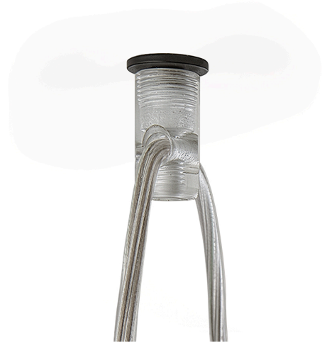
Polycarbonate suspension and adjustment device for 6mm diameter electrical cables. Usable for several cables of smaller dimensions.