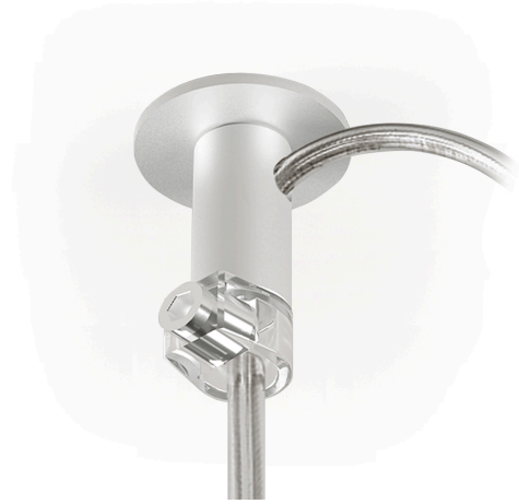
Suspension and adjustment device for electric cable.